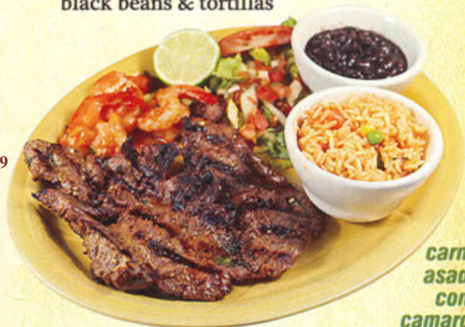
carne asada con camarones

3 tacos, rice, black beans and green sauce. Texas flank steak charbroiled to perfection served on a fresh corn tortilla topped with our homemade pico de gallo & ripe avocado slices