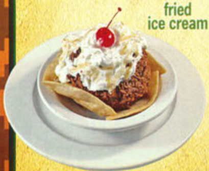
fried ice cream