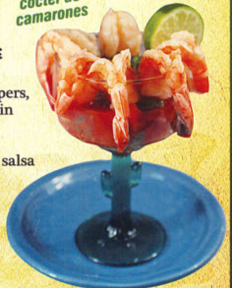
cóctel de camarones

Shredded spicy beef covered with onions, diced tomatoes & our zesty salsa on top of a thin tortilla crust & covered in cheese