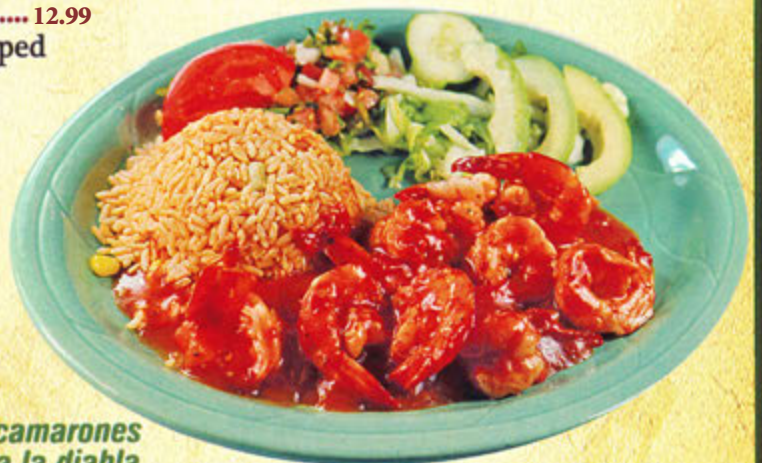
camarones a la diablo

MACHACA BURRITO PLATTER ..... 12.99 Seasoned beef with fresh ground spices served in a flour tortilla & smothered in a melted Mexican cheese blend